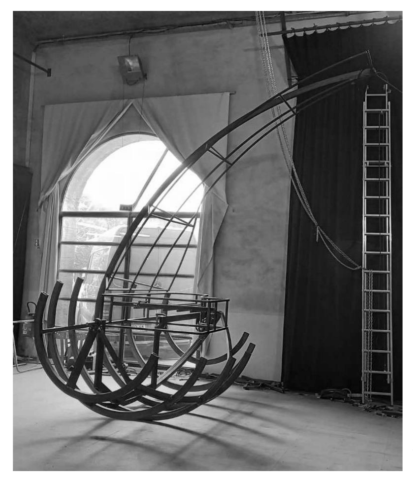
structure under construction March 2022

This ship floats on dry land, it is a sound ship. It pitches in an endless journey, to the other world. Attempting to reconcile with the invisible, with the souls of those who went before us. The captain is music, the woman is wind, her breath animates this strange piano-boat; All three, instruments of passage, inextricable transmitter-transceivers.